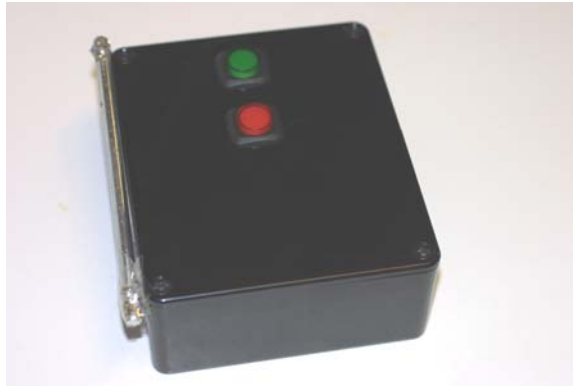
Figure 3. Custom-made navigation device.

They held the wireless device allowing for backward/forward translational movement in the direction of the head-tracked movement. Restrictions of navigation applied were based on collision detection and boundaries of head movements. The exposure time was 120 seconds. Idle time, direction of idle time as well as navigation routes were monitored through software during exposure.